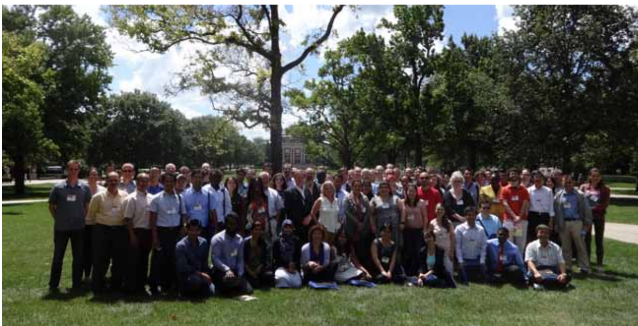
PSNA Meeting Attendees on the University of Illinois Quad

The program was very full which made for long days busy from 8 in the morning until 7 each evening. It consisted of seven symposiums covering phytochemical-based topics from plant-based "omics," lipids, metabolism, biosynthesis, chemical ecology, botanical medicines, nutritional & medicinal phytochemistry. The invited speakers included Miroslava Cuperlovic-Culf, National Research Council Canada, Moucton, New Brunswick; Dean DellaPenna, Department of Biochemistry and