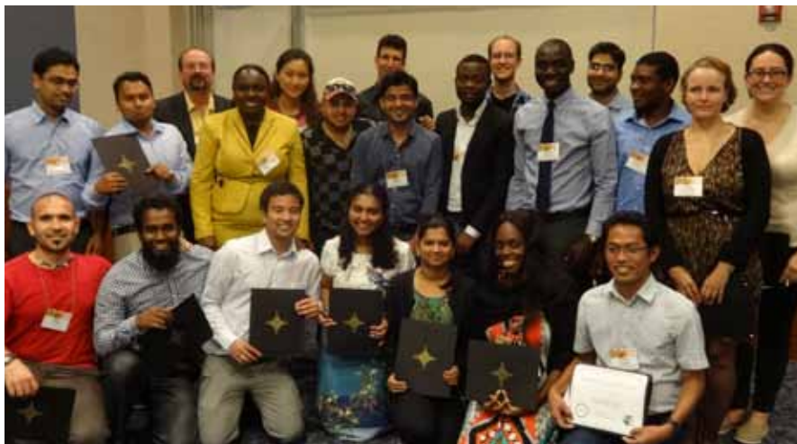
Frank & Mary Loewis Travel Award Winners